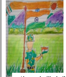
~Ahanangshu Ghosh, 4I