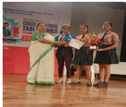
SXI Panihati at T.T U19 Girls Group Champion of CISCE.

We all bear witness to yet another remarkable feat achieved by the Suburban Educational Society, as the Sahaj Path Library , which celebrated its first birthday on 1st August 2019 strews a success story, boasting more than 600 proud members, 10 aspirants having secured government jobs, and an even brighter future.