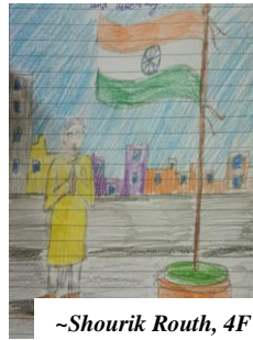
~Shourik Routh, 4F