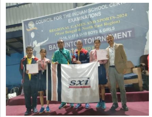
Students of SXI shine at the CISCE REGIONAL BADMINTON TOURNAMENT IN DARJEELING.