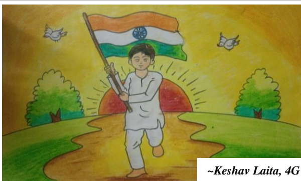
~Keshav Laita, 4G