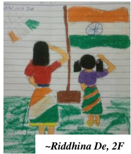
~Riddhina De, 2F